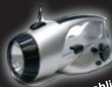
CAA Flashlight Radio

Please call: 1-800-341-2226 Mon-Fri 9a.m. to 4p.m. anytime 416-806-2557 Toll free: 1-877-453-5169