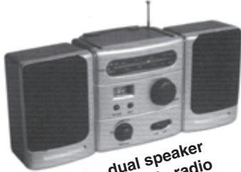
dual speaker portable radio

RETAIL MEMBERSHIP Basic: $75.60 Plus: $110.58 Tax included